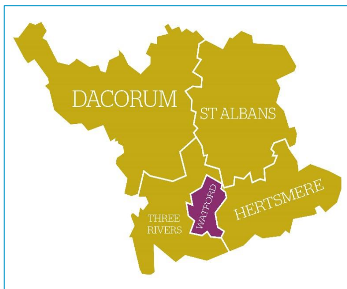
Figure 3. Area covered by the South West Hertfordshire Joint Strategic Plan

Watford shares a variety of cross boundary issues with neighbouring areas. Collaborative working to discuss shared issues and constructively consider how these can be addressed through coordinated development has improved, and continues to do so, over time. Watford has also been working collaboratively with other partners to support development including the Local Enterprise Partnership.