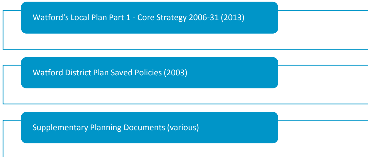
Figure 1. Watford Local Plan Documents

The revised National Planning Policy Framework (2018), and accompanying National Planning Policy Guidance (NPPG) are material considerations but do not form part of the Development plan.